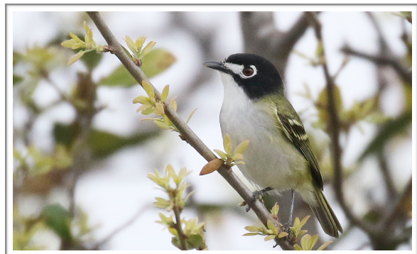
Golden Cheeked Warbler ( Setophaga chrysoparia ) and Black-capped Vireo ( Vireo atricapilla )

Our Firewise® representatives have determined that wildfire risk mitigation from the dense vegetation is needed. Steps have been take to reduce the potential for damage to our neighborhood in the event of a wildfire. These include removal of “dead and